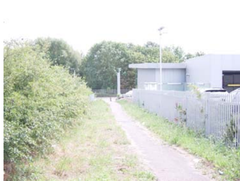
Looking east from Folly Farm crossing (industrial buildings nearby)