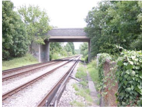
Looking towards Farleigh Road Bridge (and Folly Arm crossing) from Park Alley crossing