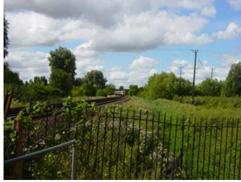
Looking south from Tonford crossing