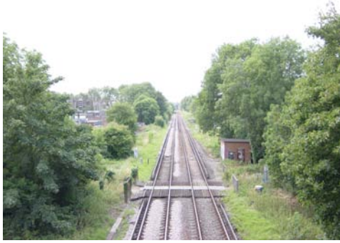
Park Alley crossing from Farleigh Road bridge (looking south-west)