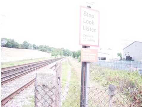
Looking north-east from Tonford crossing