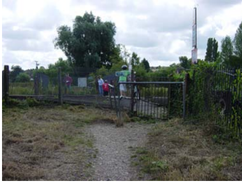
Looking west across Tonford crossing