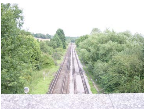
View from Farleigh Road Bridge towards Folly Farm Crossing (down whistle board in foreground)