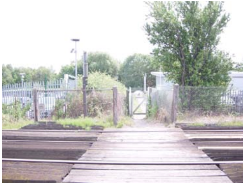
Looking east across Folly Farm crossing