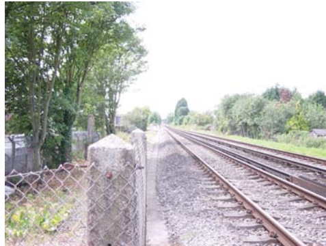
Looking south-west towards Farleigh Road Bridge and Park Farm Crossing from Tonford crossing